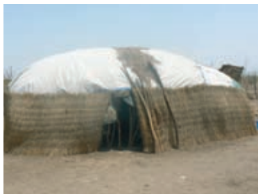
Figure 2. Afar traditional houses, which are constructed by women