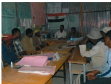
Figure 1. Women's and men's focus group discussions